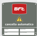
CMS - D831081 Sign