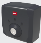
Q.BO KEY WM AV - P121023 Vandalproof key selector with metal structure. Vandalproof key selector with double contact, for outdoor use. Metal structure.