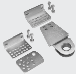
ARB PHOBOS N L - N733428 Front and rear adjustable bracket for PHOBOS NL, PHOBOS NL BT operator