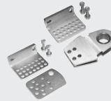
ARB PHOBOS N - N733427 Front and rear adjustable bracket for PHOBOS N, PHOBOS N BT operator