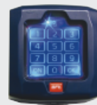
Q.BO TOUCH - P121024 Wireless digital touch button panel 433Mhz rolling code.