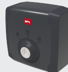
Q.BO KEY WM - P121022 Key selector for outdoor use with double contact.