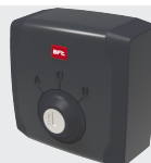
Q.BO KEY WM - P121022 Key selector for outdoor use with double contact.