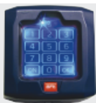
Q.BO TOUCH - P121024 Wireless digital touch button panel 433Mhz rolling code.